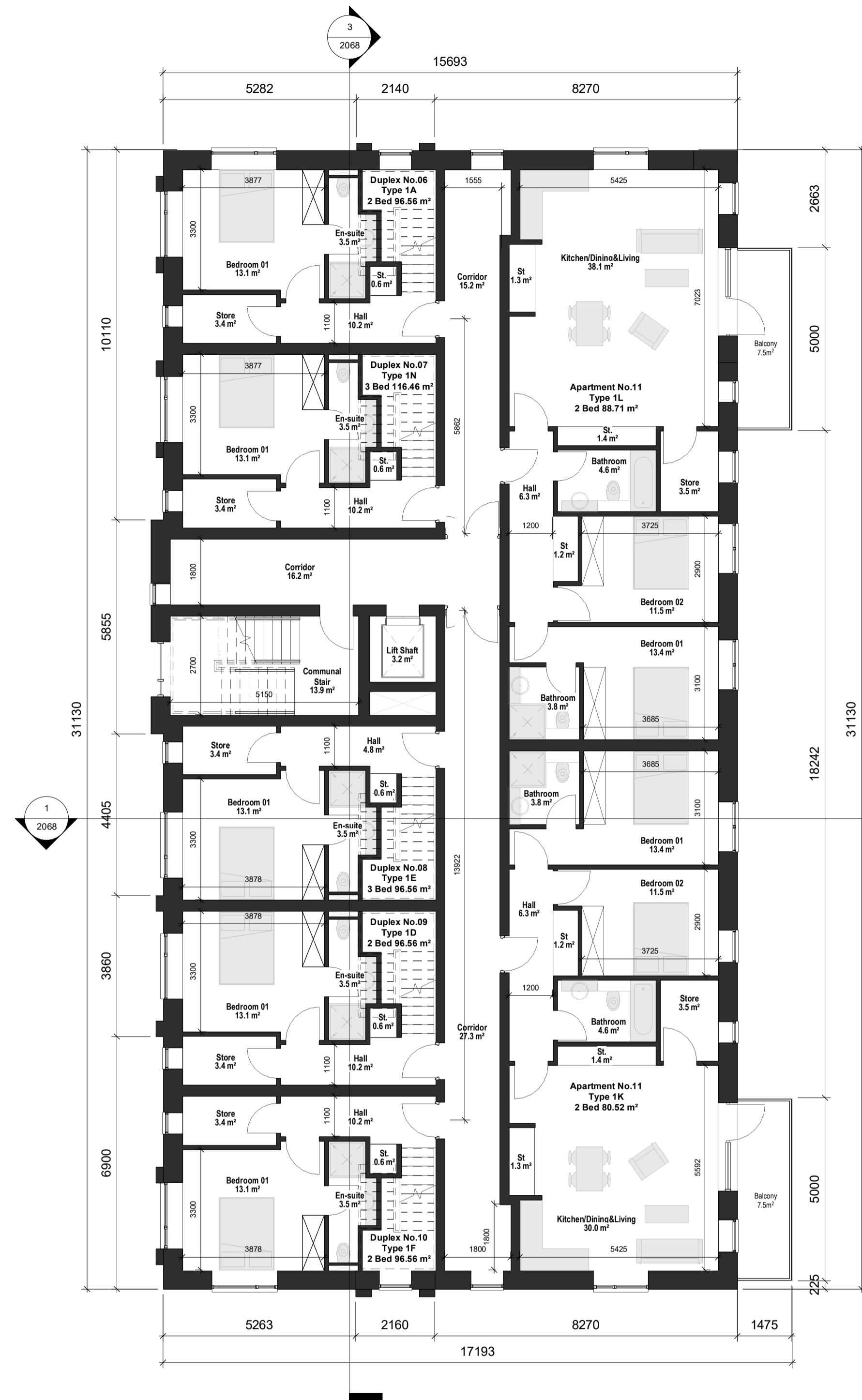
1 Proposed Block C (Duplexes/apartments - Type B) - Building 2 - Second Floor Plans 1 : 100